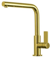
VERONA GOLD R497 G09